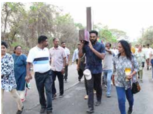
Carrying Hope: Jubilee way of the Cross.

The total distance covered was 13.9 kms. Parishioners belonging to different age groups, including senior citizens, took part in the