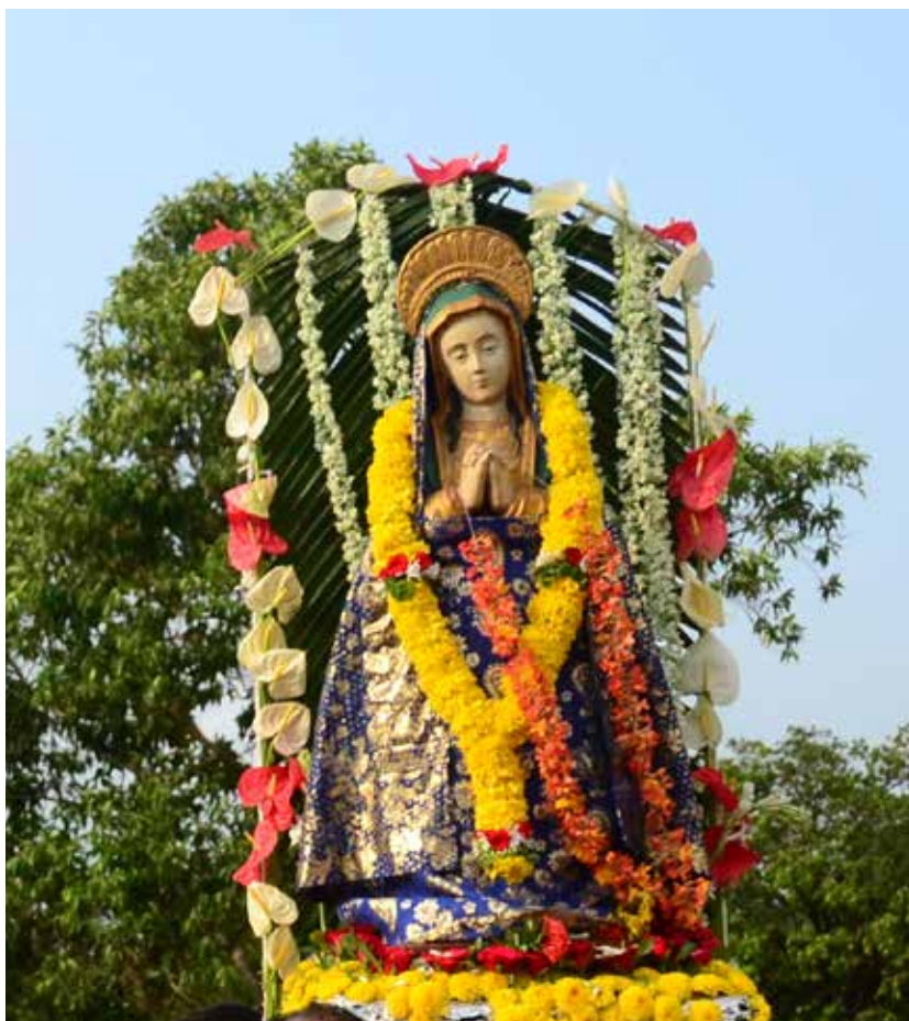
TIN GORZANCHE SAIBINNI DOIEN AIK AMCHI MAGNNI

As we celebrate this special feast in our parish .Let us entrust our work and our needs to Our Lady of Three Necessities, asking her to intercede for us, hope that sustains us, and love that moves us on every task, every season every necessity.