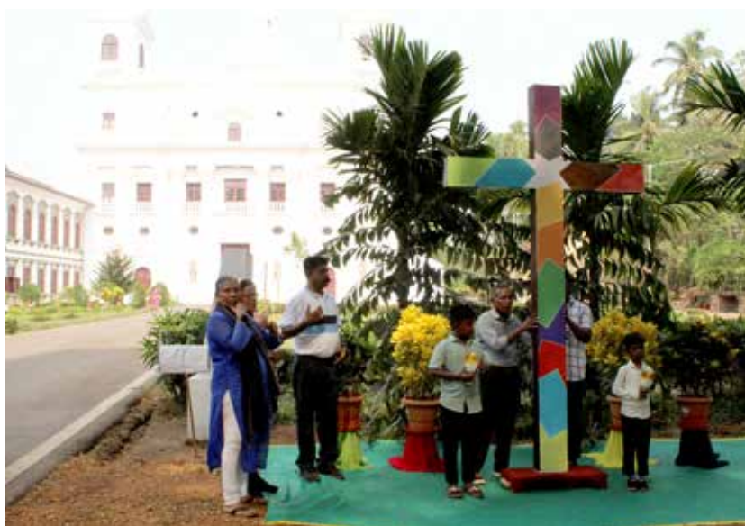
Pilgrims of Hope: The 1st Station, Blessed Rani Maria Somudai members at the foot of the Cross

devotional music was played to maintain a prayerful and reflective atmosphere.