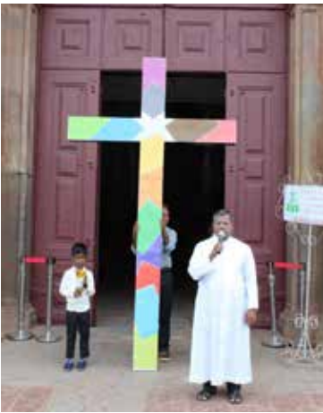
14 colours, 14 Somudai, One faith: Our Parish begins the Way of the Cross

O n March 30, 2025, the Parish of Old Goa observed the Jubilee Way of the Cross, a devout walk with the Cross winding its way through the entire parish. Organized by the See Cathedral Jubilee Year Committee 2025, this solemn act of faith and devotion aimed to bring together the faithful in reflection on Jesus' sufferings in the Holy Season of Lent. Notably, the cross bore 14 different colours representing the 14 somudais within the parish.